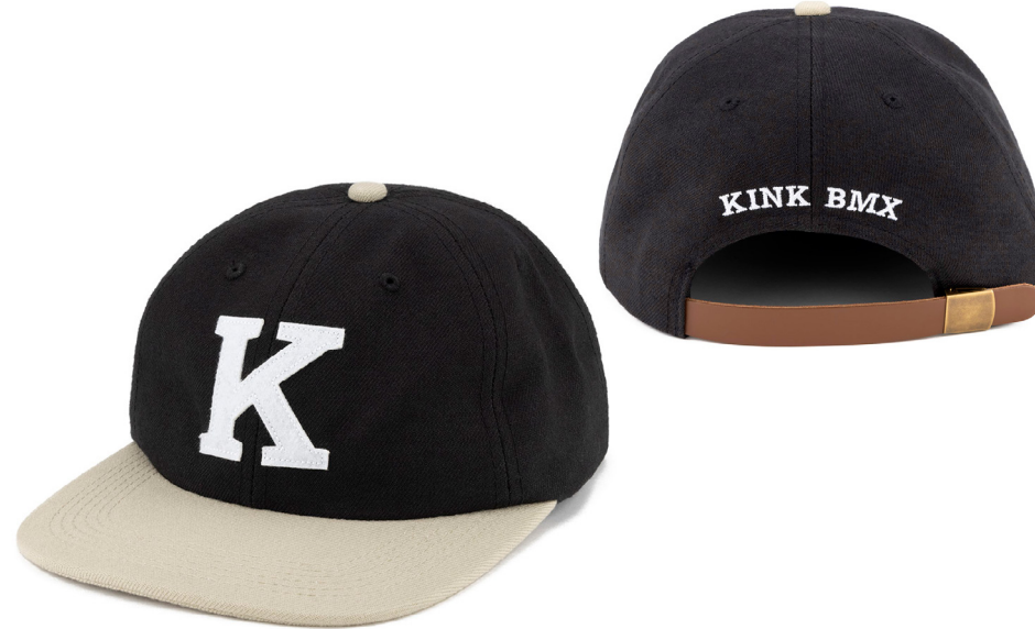
FRANCHISE HAT Black/Tan