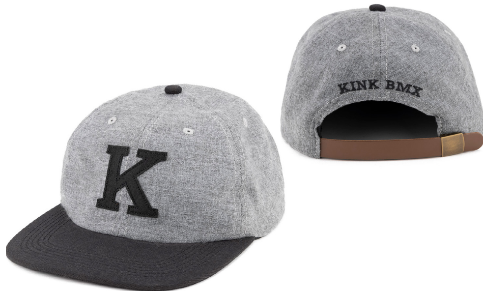
FRANCHISE HAT Grey/Black