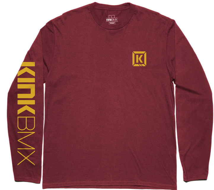
BRANDED LONGSLEEVE TEE Maroon