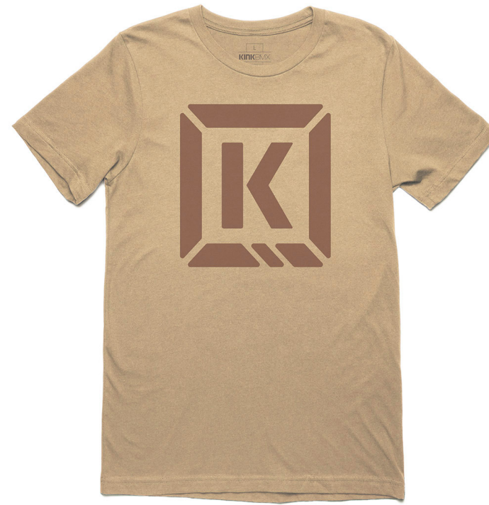
REPRESENT TEE Tan