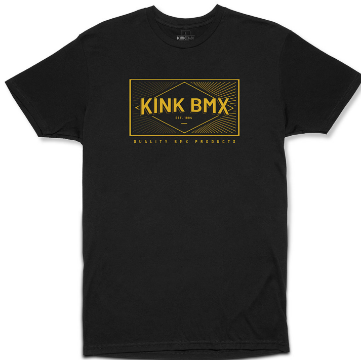
ECLIPSE TEE Black