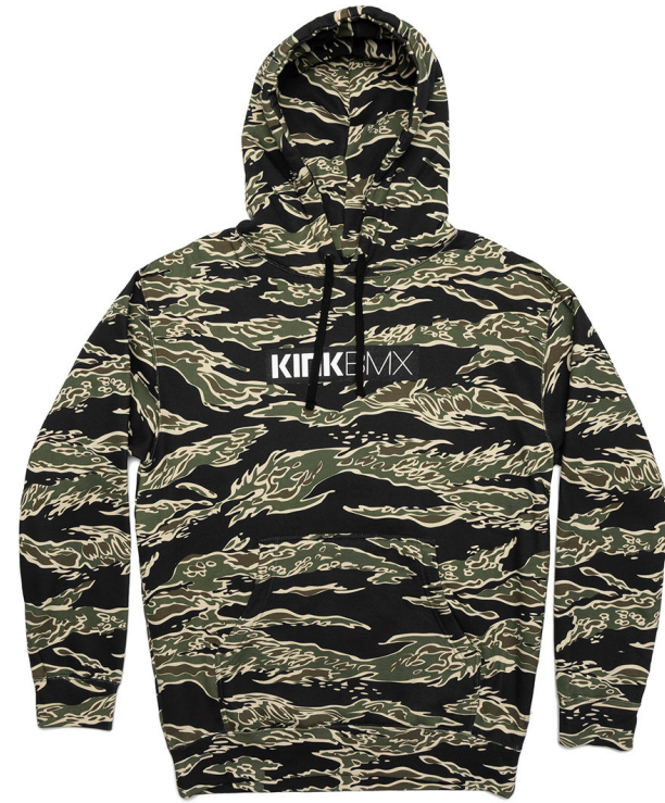
BLOCK PULLOVER Tiger Camo