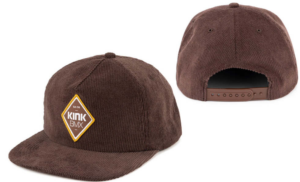
Cord Hat Brown