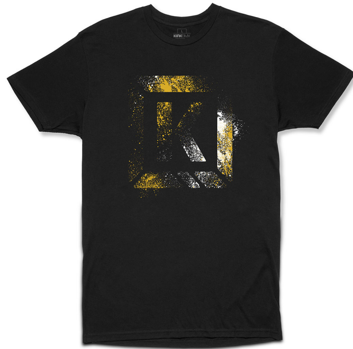
BURST TEE Black