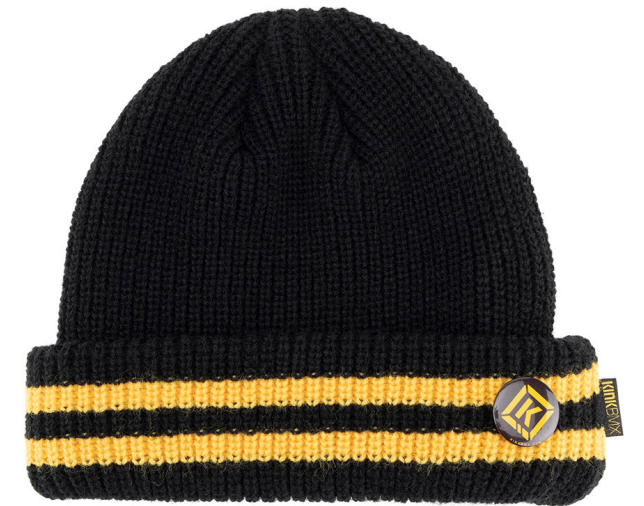
SKULLY BEANIE Black/Gold