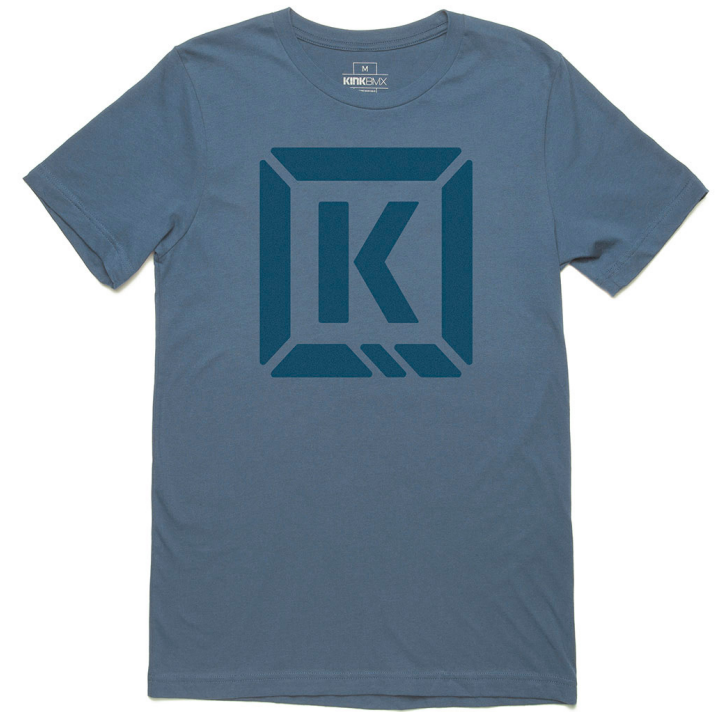
REPRESENT TEE Steele Blue