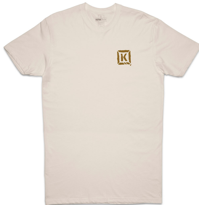
SPLAT TEE Vintage White