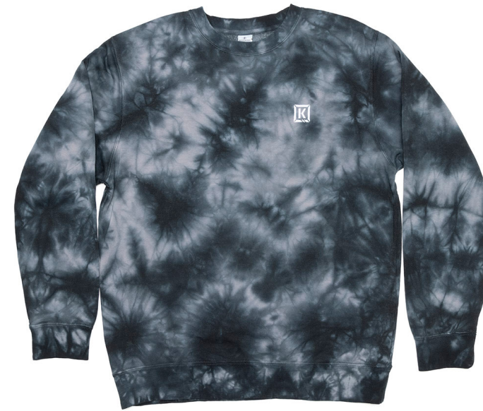
CLEAN CREWNECK Black Tie Dye