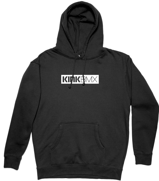
BLOCK PULLOVER Black