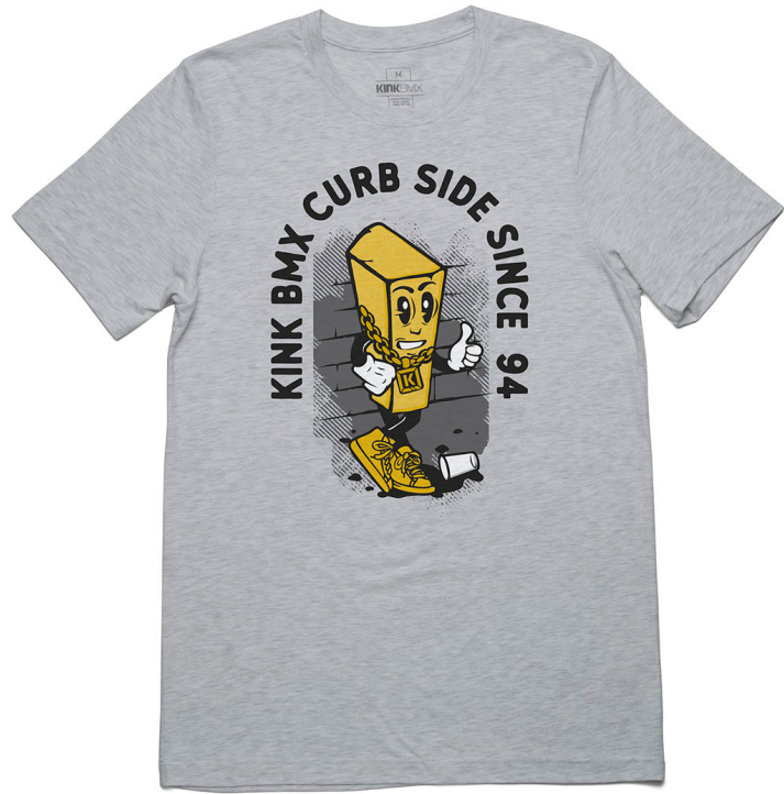
CURB MAN TEE Heather